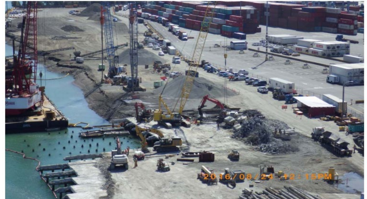
Pier 4 Reconstruction including 'Stone Column' installation